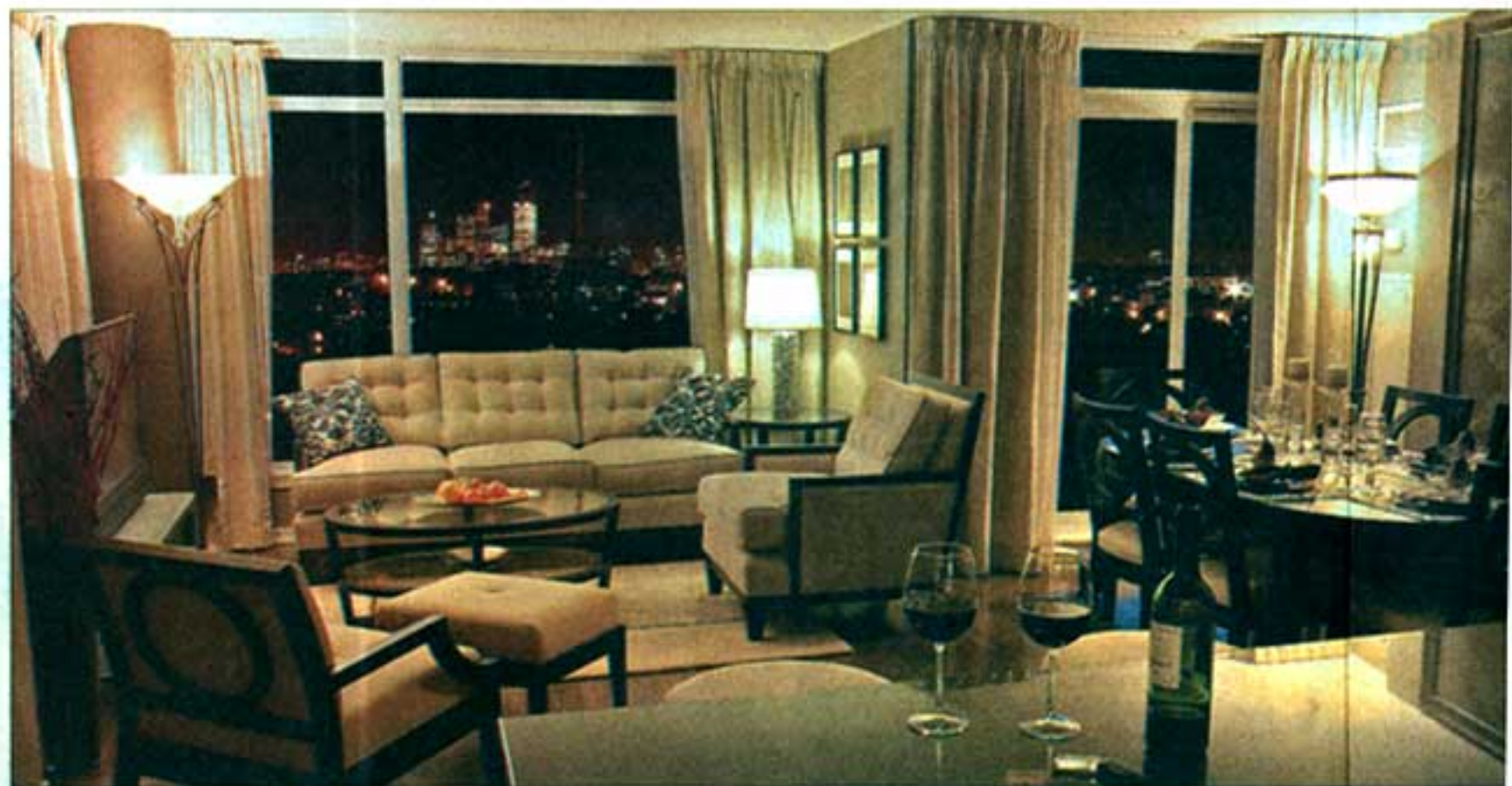
Scaled-down furnishings and a monochromatic colour scheme lend elegance and versatility to the living and dining areas.

In the living room, a perfectly scaled sofa with low English arms takes up little room but still offers three comfortable seats. In the dining area, a bow table (rectangular with rounded